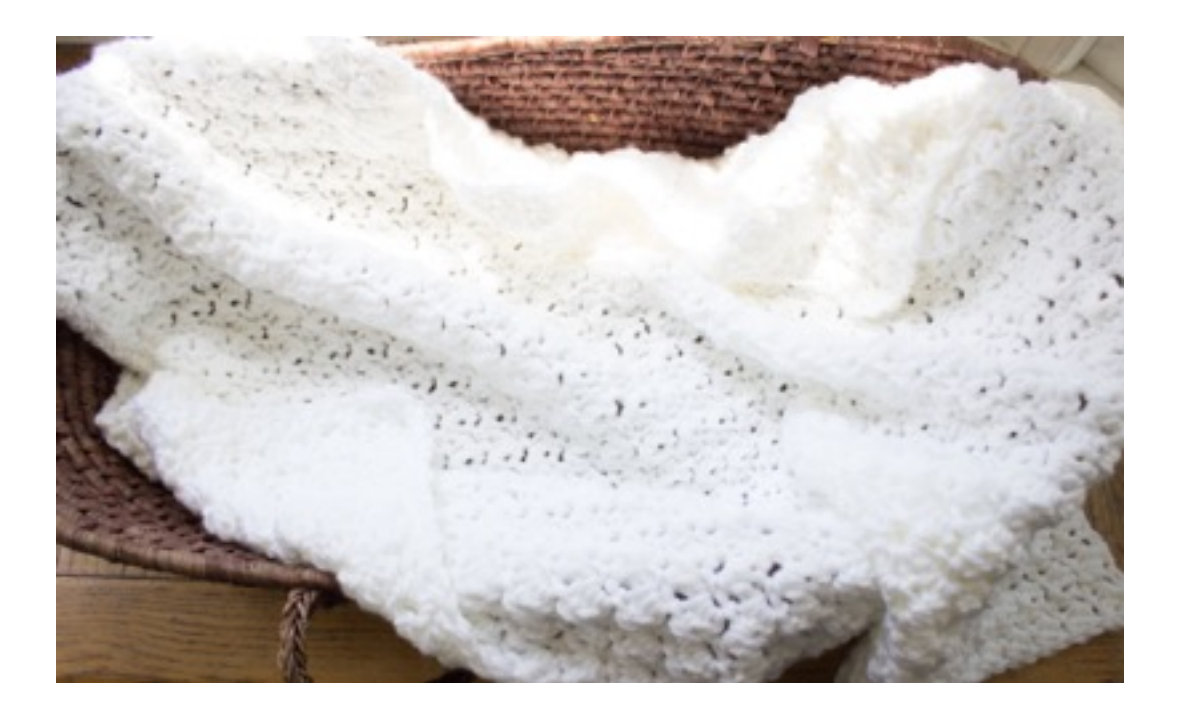
Simply Paggie SimplyMaggie.com Please do not resell this pattern in any form. Thank you in advance!